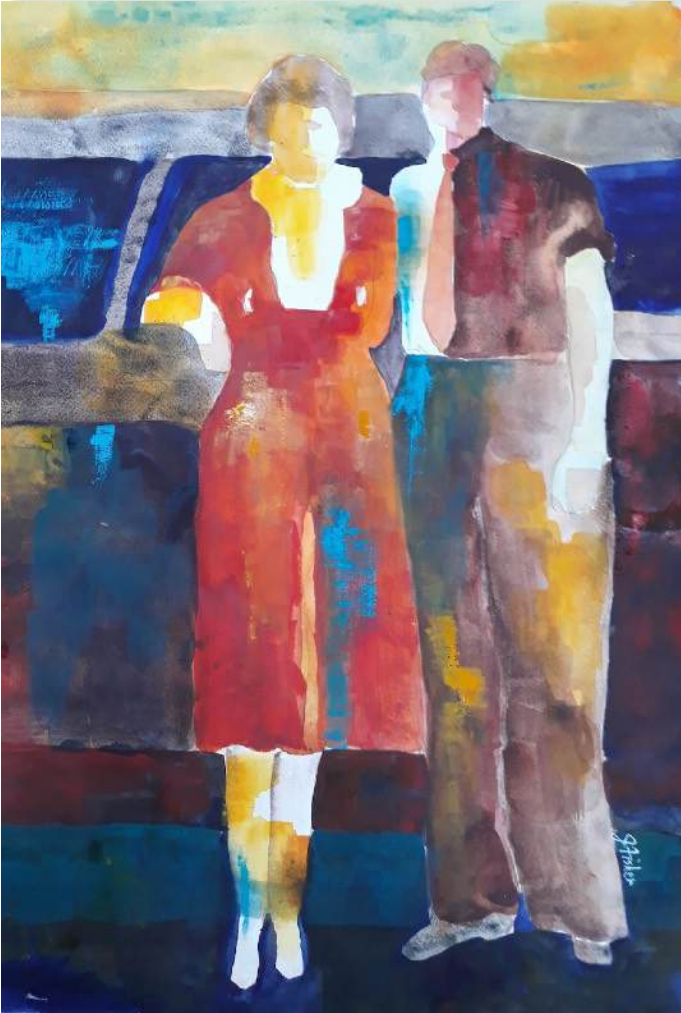
"Coupled," a watercolor by June Fisher-Markowitz