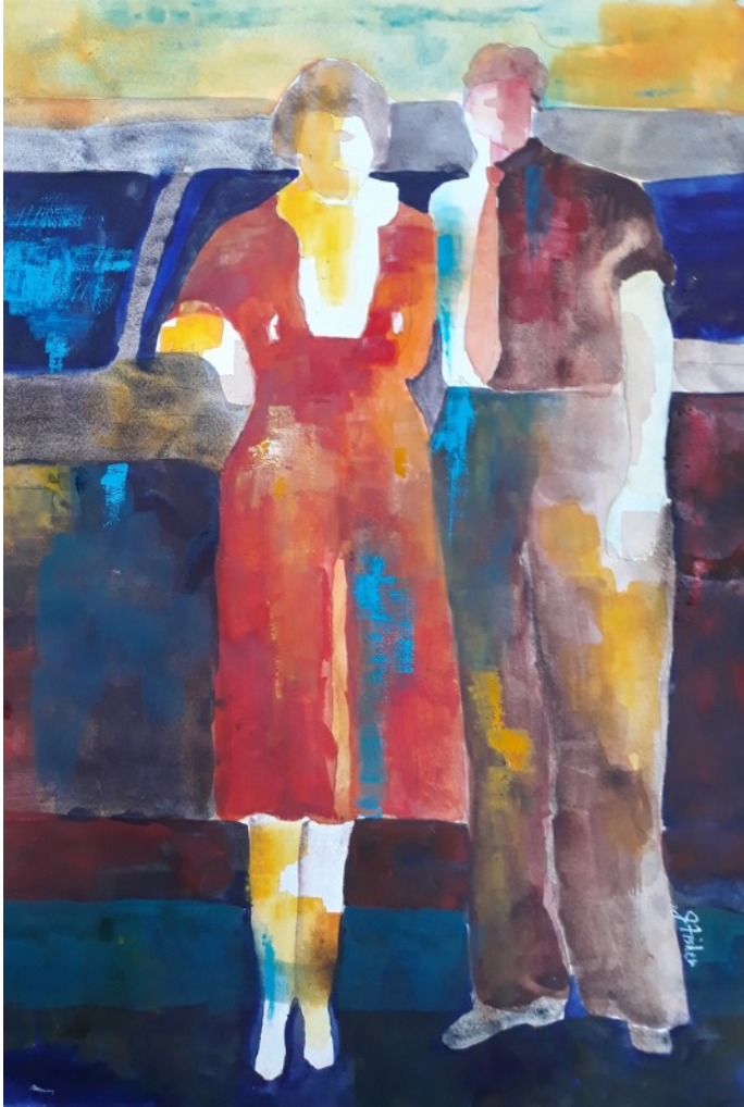
"Coupled" by June Fisher-Markowitz